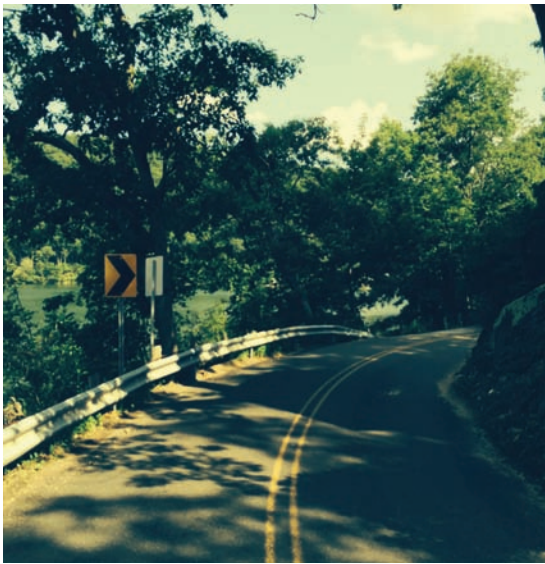
Site of McDevitt Gazebo, West Shore Road, July 2014