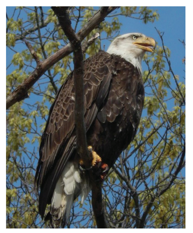
A bald eagle perches in the budding branches of Arrow Point, May 2014.

For aspiring birders in our community, the electric utility company which owns and operates several area hydroelectric facilities opens a Bald Eagle Observation Area at the Shepaug Hydroelectric Dam during the first quarter of the year. Viewings can be prolific; some reports mention ten eagle sightings in one day, as well as other birds of prey including red-tail hawks, sharp shinned hawks and goshawks, not to mention the great blue herons as well as other waterfowl. For more information and reservations, please see www.shepaugeagles.info