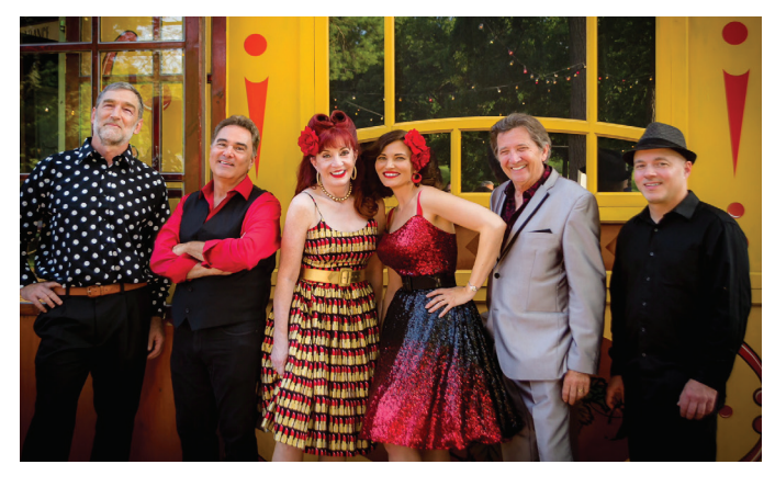
The Community Picnic will feature - Eight to the Bar, this year's winner of Best Overall Band in Connecticut

Please join your friends and neighbors on the shores of our mutual interest! The Lake Waramaug Country Club has graciously opened their Beach for use by the Lake Waramaug Association to come together and connect with our neighbors, prior to our return to autumnal reality. Please bring your own picnic and your dancing shoes, as Eight to the Bar, this year's winner of Best Overall Band in Connecticut by CTNOW Best of Hartford Readers' Poll, will be back to entertain us, compliments of the Lake Waramaug Association. We will also sponsor an ice cream truck, so dessert is on us! Festivities will take place on Saturday evening, August 25th at 6 o'clock PM, and wrap up at nightfall. We ask that you please dispose of your rubbish upon departure.